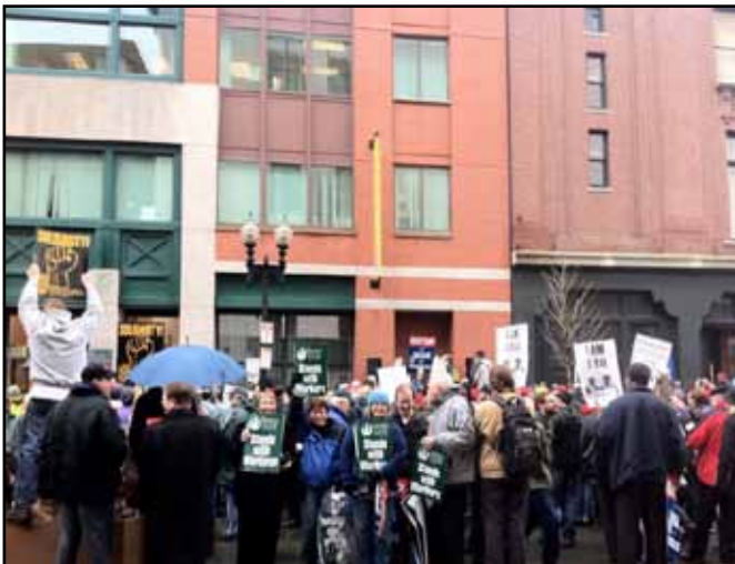
Sierra Club members join with Union Workers to unite for worker and environmental rights.