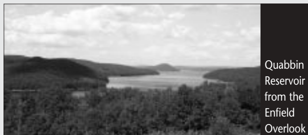
Quabbin Reservoir from the Enfield Overlook