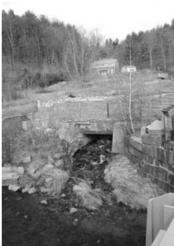
A stream emerges at Sheldon Street, Fitchburg

There are many less ambitious possibilities for restoring or at least embracing an urban waterway. A simple start is to raise awareness that there is a river in your community.